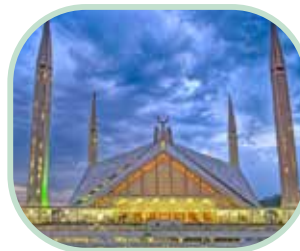
Shah Faisal Mosque