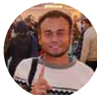
NAZERAN 019-382 9202