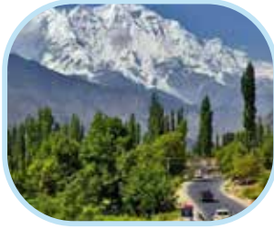
Rakaposhi View Point